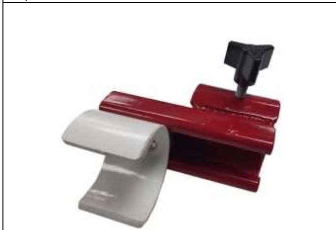
2" Contact Jig (Standard)