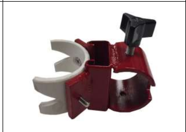
2" Fitting to Fitting Contact Jig