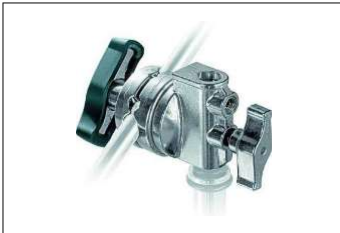
Avenger 2 1/2" Grip Head with "T" Top and 5/8" Socket