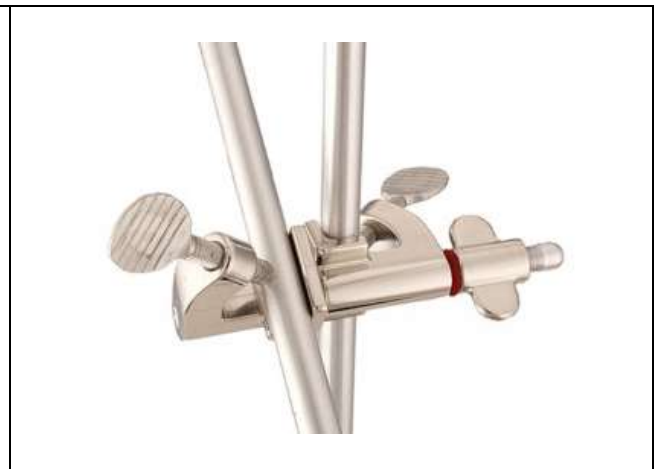
Swivel Clamp Holder