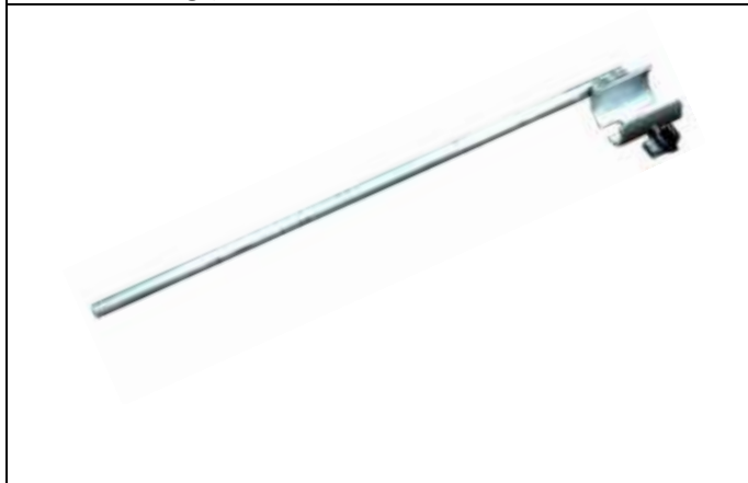
18" Aluminum Source Stick with Built-In Collimator Holder