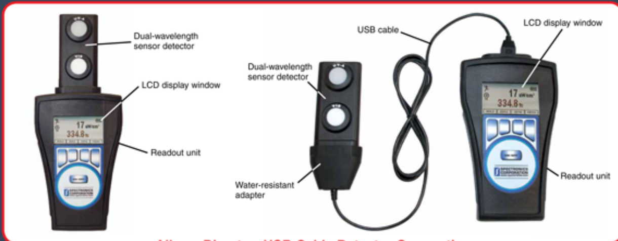
Allows Direct or USB Cable Detector Connection