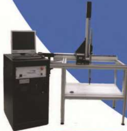
3 Axis Lab Immersion Scanner

TecScan will perform complete verification of the electric and mechanical components.